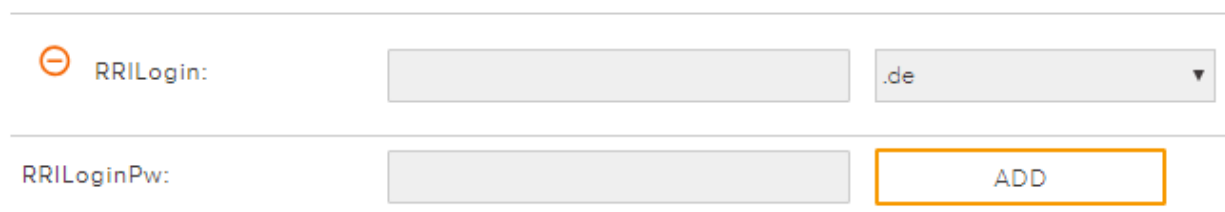
Figure 4: Section in the registration account to set up an RRI login

Complete the RRI Login field with a handle. In the dropdown list, select .de.